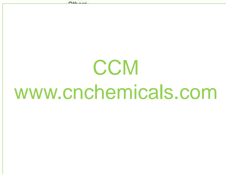
Figure 5-2 Application share of metolachlor technical in China by crop, 2017