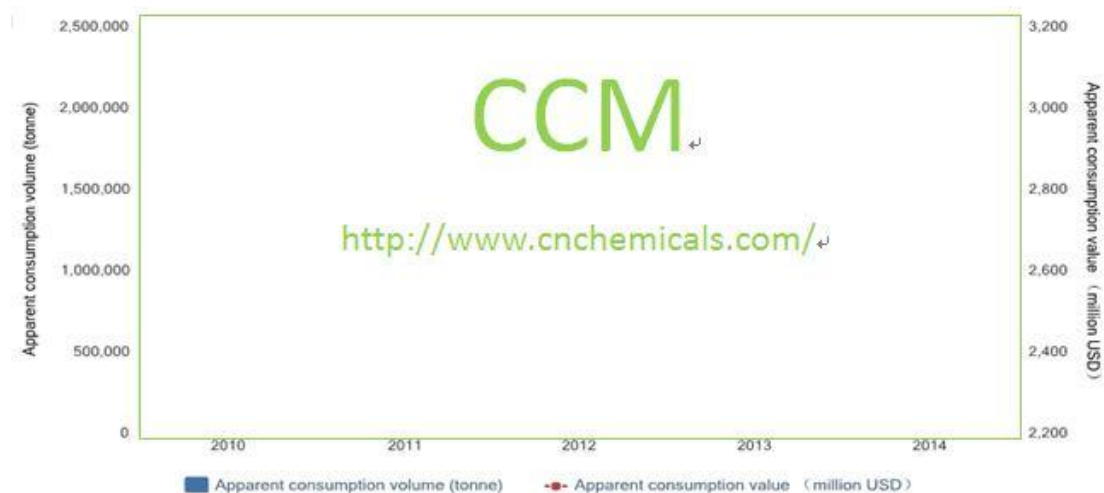
Figure 2.6.1-1 MSG consumption situation in China, 2010-2014