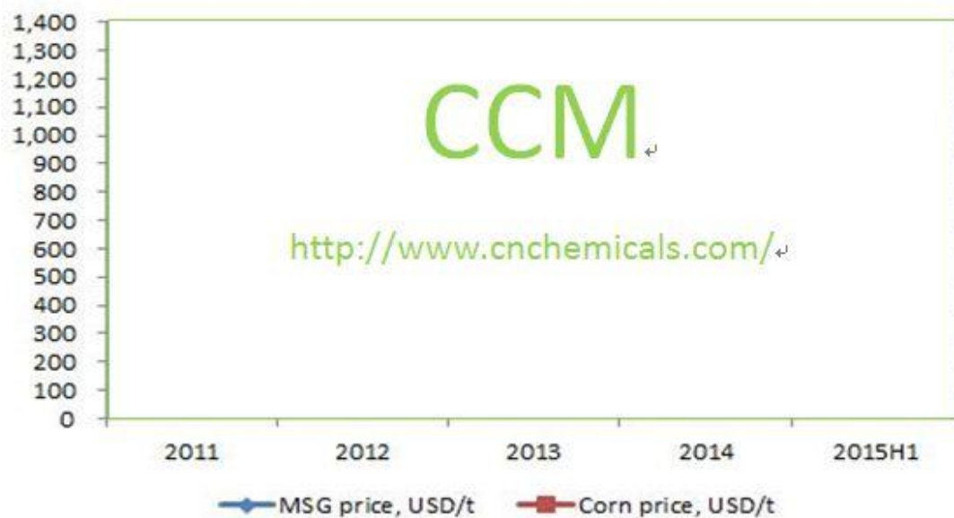
Figure 2.4-1 Prices of MSG and corn in China, 2011-H1 2015