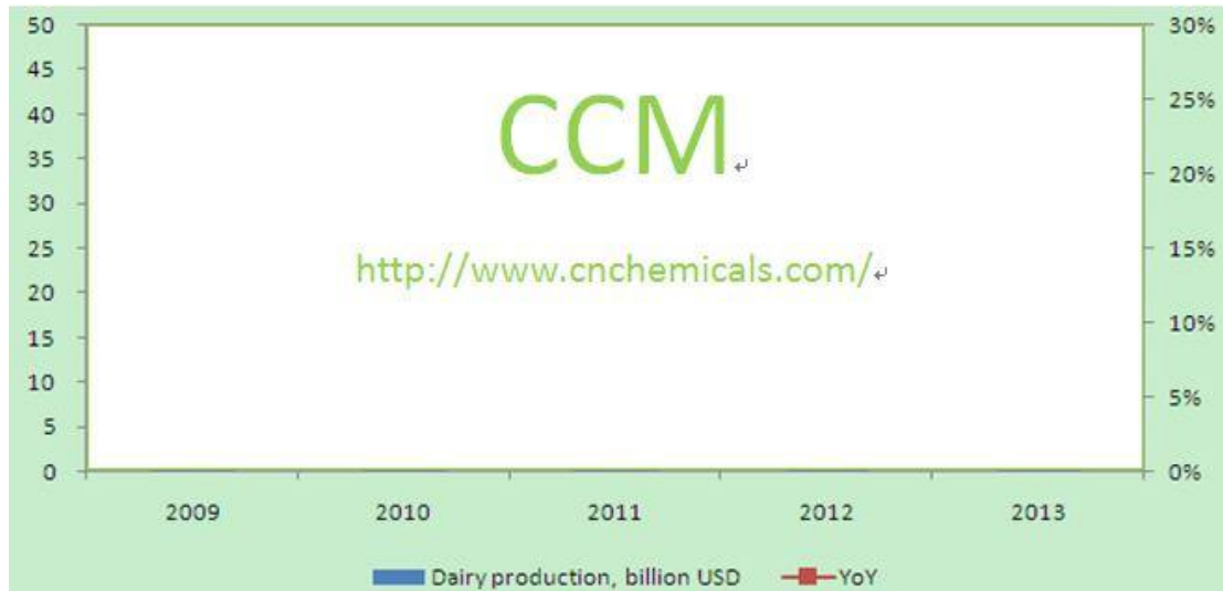
Figure 1.1-1 Dollar value of China's dairy industry production, 2009-2013

Source: National Bureau of Statistics of China